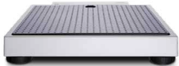
The flat design and slip-proof surface ensure easy access and a secure stance.