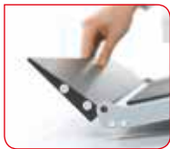
Integrated ramp folds up for trouble free transport.