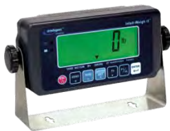
Optional Intell-Weigh™ 10 Indicator