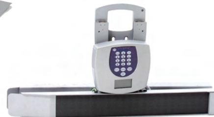
2400KL when folded for easy portability

US PATENT #D508655, #D523367, #7550682B2 CHINESE PATENT PENDING #200730323457.7, 200730323458.1