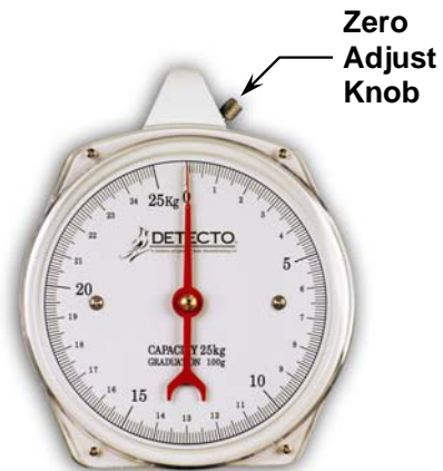
Figure No. 2

NEVER leave a baby unattended in the Baby Sling Seat. Failure to maintain control of the baby at all times while they are in the Baby Sling Seat can result in serious injury to baby.