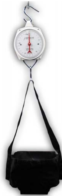
Figure No. 1