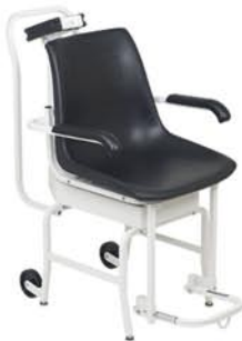
6475 Chair Scale