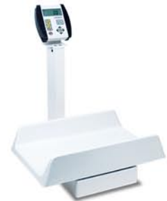
8435 Pediatric Scale