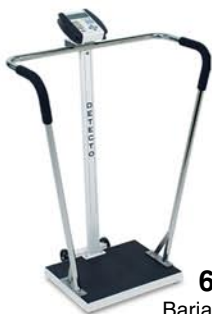
6855 Bariatric Scale