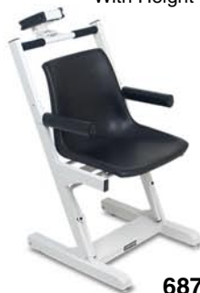
6875 Chair Scale