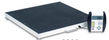
6800 Bariatric Scale