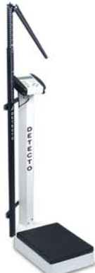
6129 Waist-High Scale With Height Rod