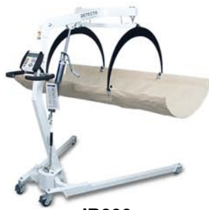
IB800 In-Bed Scale