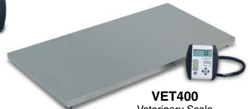
VET400 Veterinary Scale