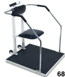
6868 Bariatric Flip Seat Scale