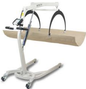
IBFL500 In-Bed Scale