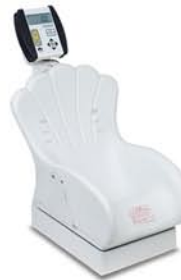
8432CH Pediatric Scale