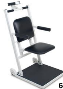
6876 Bariatric Flip Seat Scale