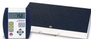
GP400-750 Platform Scale