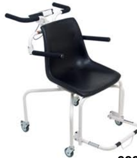
6880 Chair Scale