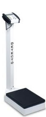
6127 Waist-High Scale