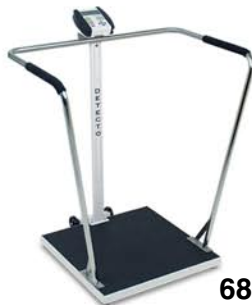
6856 Bariatric Scale