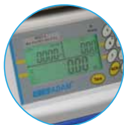
Back Lit LCD Displays