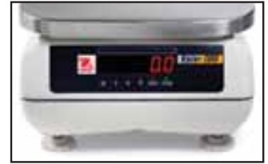
Valor 2000 with standard rear LED display