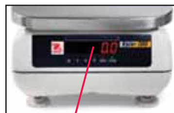
Bright, 7-Segment LED Display on Rear of Scale

Dishwasher Safe, Stainless Steel Weighing Pan