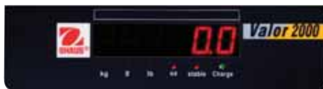
The Valor 2000 Food Processing Scale has front and rear LED displays, increasing throughput and efficiency by allowing multiple users to operate the scale at the same time.