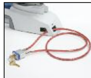
Security Device accessory (Lock & cable sold separately)