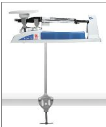
Included Rod & Clamp accessory for specific gravity experiments