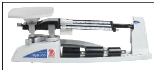
Three masses included with balance