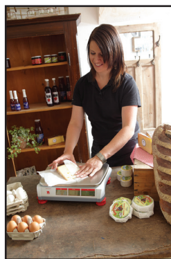
Aviator in the Cheese shop