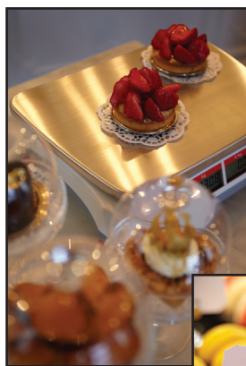
Specialty Shop: Sweets, tea, chocolate