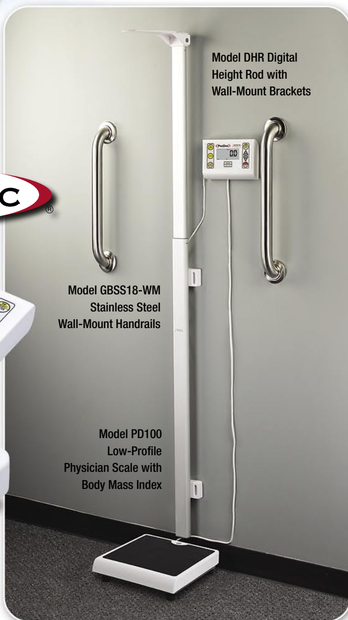
Model DHR Digital Height Rod with Wall-Mount Brackets