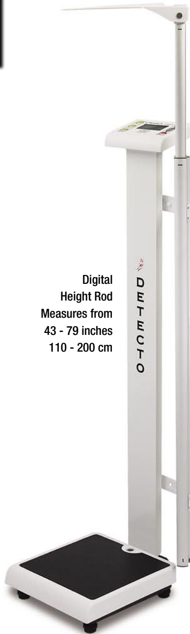
Model PD300DHR Eye-Level Physician Scale with BMI and Digital Height Rod