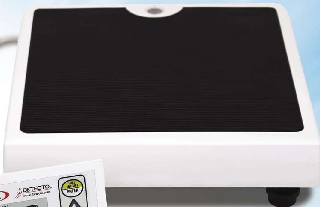
Detecto Model PD100 Low-Profile Physician Scale with Body Mass Index

MEDICAL GRADE ACCURACY: WEIGHT • HEIGHT • BMI