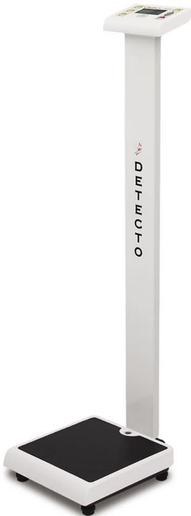
Model PD300 Eye-Level Physician Scale with Body Mass Index

The optional P50 direct thermal printer may be mounted on any of the ProDoc® PD300 series eye-level physician scales to print Time, Date, Height, Weight, and Body Mass Index. The P50 features two-button operation and RS-232 serial communication with the scale (cable included with printer).