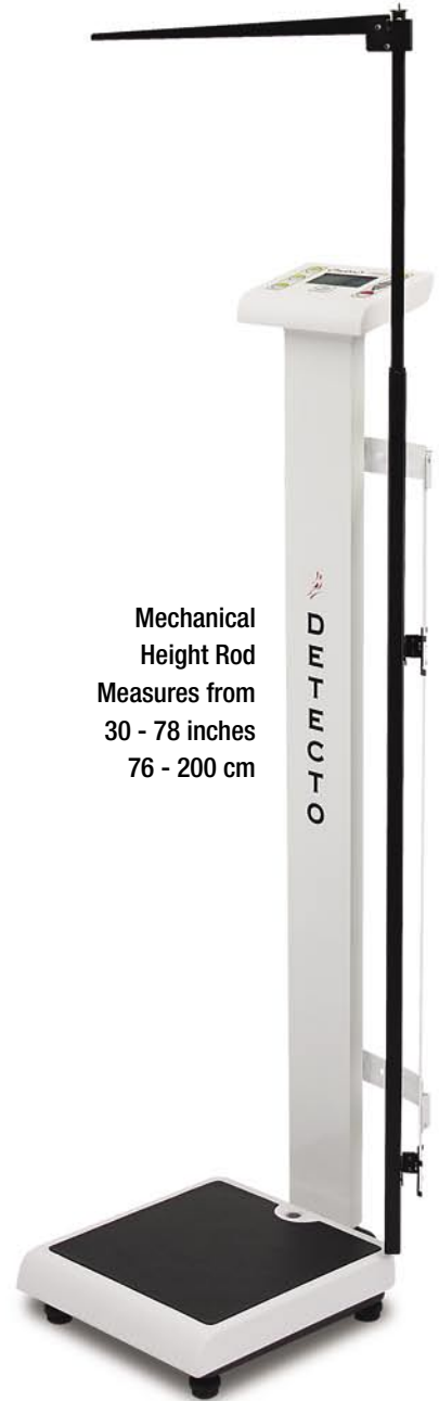
Model PD300MHR Eye-Level Physician Scale with BMI and Mechanical Height Rod