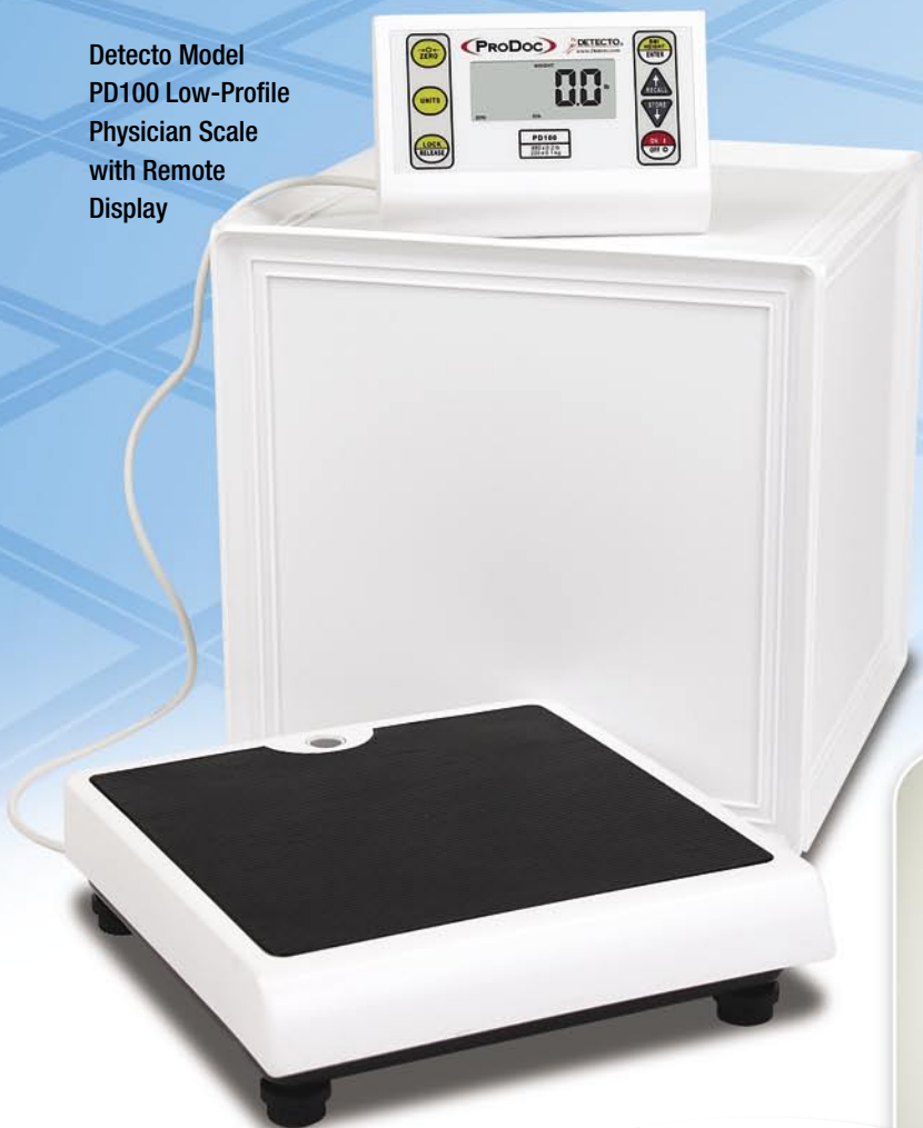
Detecto Model PD100 Low-Profile Physician Scale with Remote Display