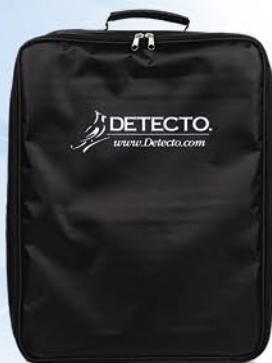
Optional model PRODOC-CASE carrying case for PD100

DHR wall-mount digital height rod and model GBSS18-WM stainless steel handrails to create an all-digital clinical measurement station.