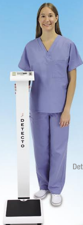
Detecto Model PD300