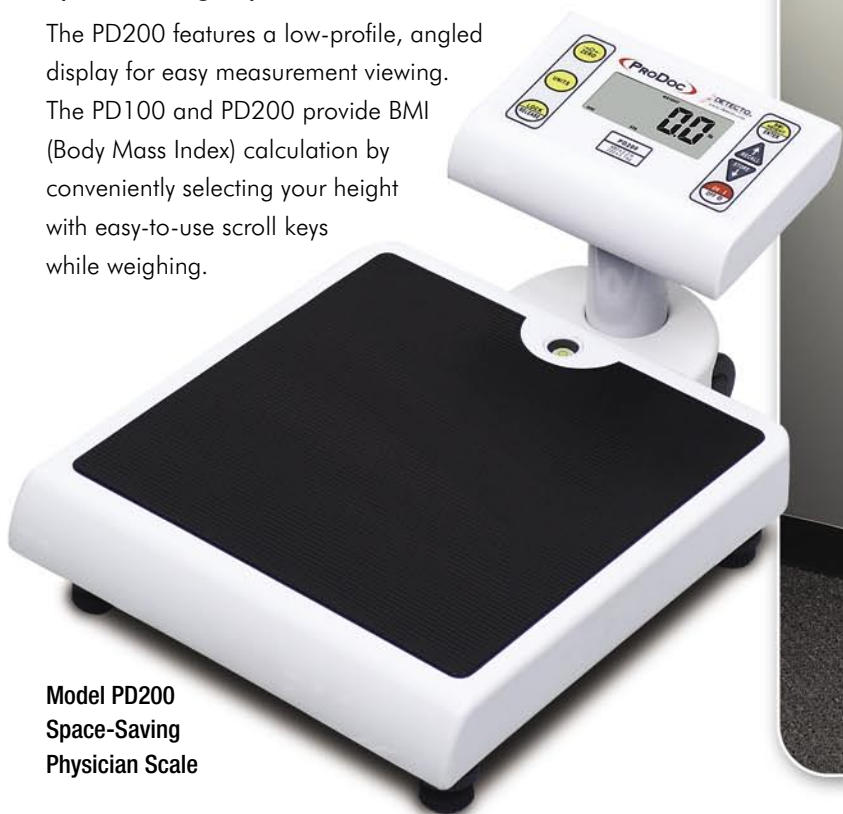
Model PD200 Space-Saving Physician Scale

The PD200 features a low-profile, angled display for easy measurement viewing. The PD100 and PD200 provide BMI (Body Mass Index) calculation by conveniently selecting your height with easy-to-use scroll keys while weighing.