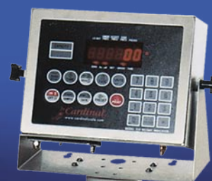
EB-300 with 210 Indicator