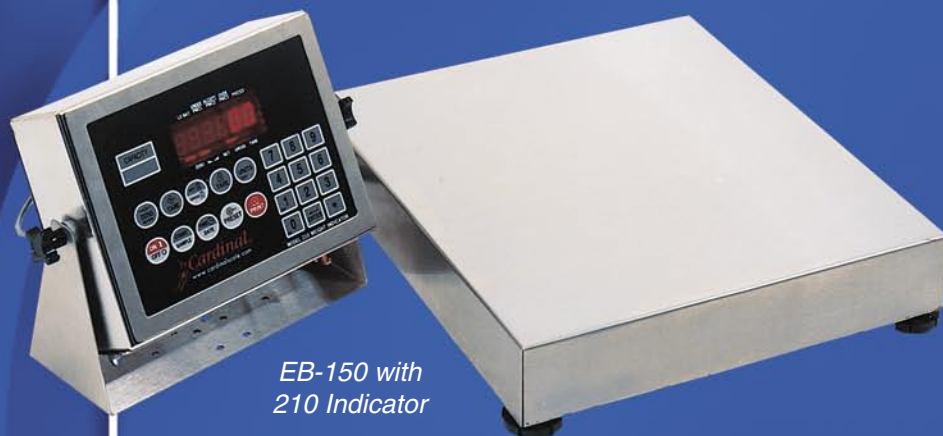
EB-150 with 210 Indicator

Designed for top performance and long-term accuracy.