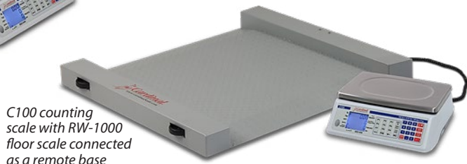
C100 counting scale with RW-1000 floor scale connected as a remote base

Cardinal Scale's C series scales with rechargeable battery are ideal for inventory counting where mobility is a must! These durable counting scales feature a full keypad to enter and recall known piece weights and tare weights, metric conversion, large backlit single LCD, bubble level, and non-skid feet for stability.