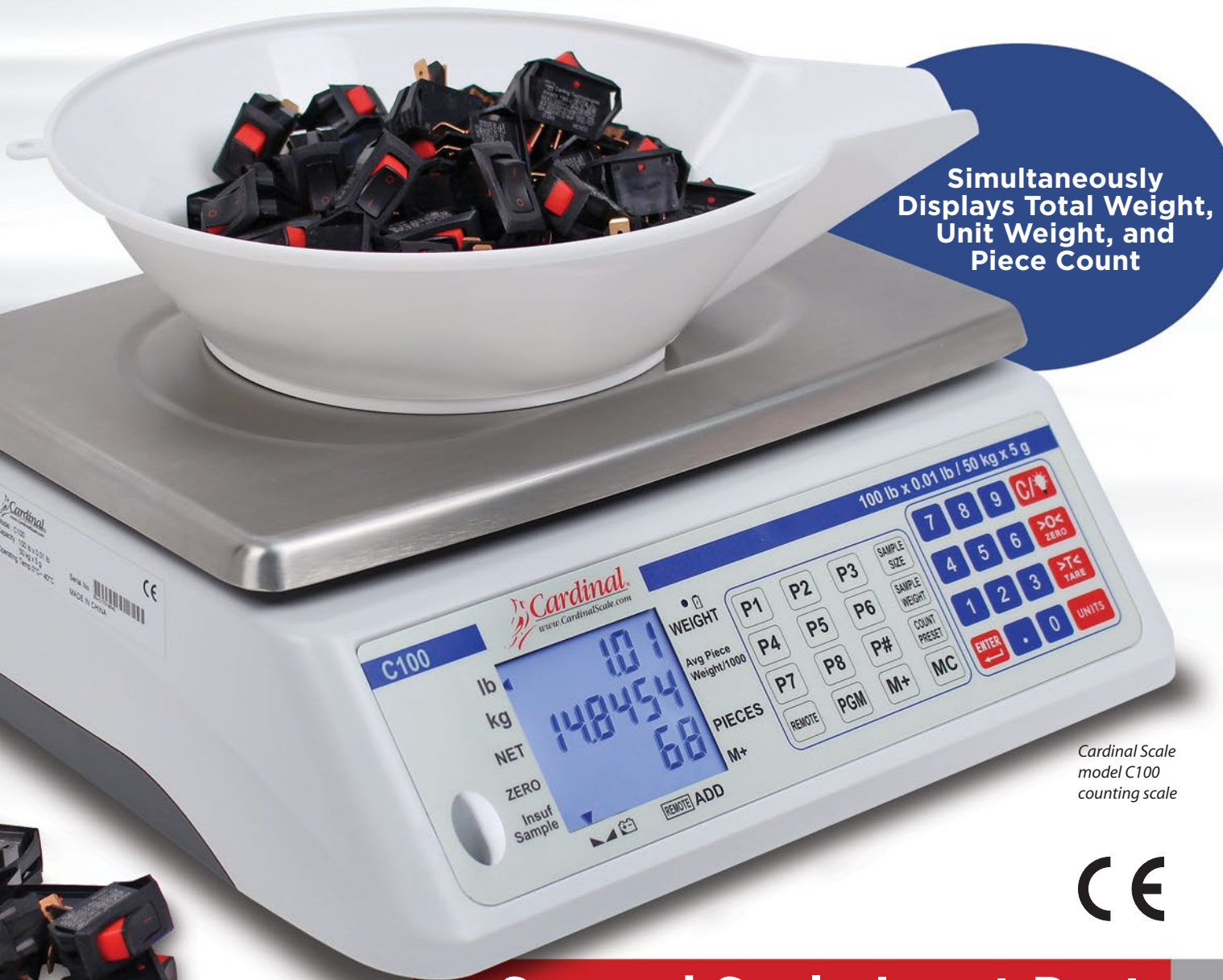
Cardinal Scale model C100 counting scale