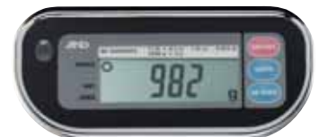
Metric mode, SK-WP models