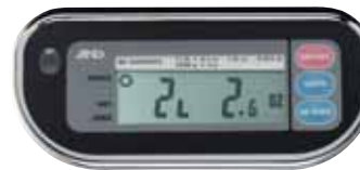
Lb/decimal oz mode, SK-WPZ models