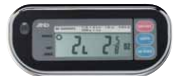
Lb/fractional oz mode, SK-WPZ models