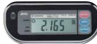
Lb mode, SK-WP models