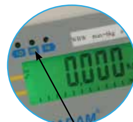
Colored LED indicators