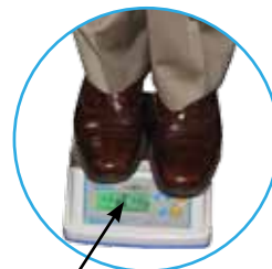
Advanced overload protection