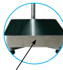
Stainless steel (grade 304) top pan